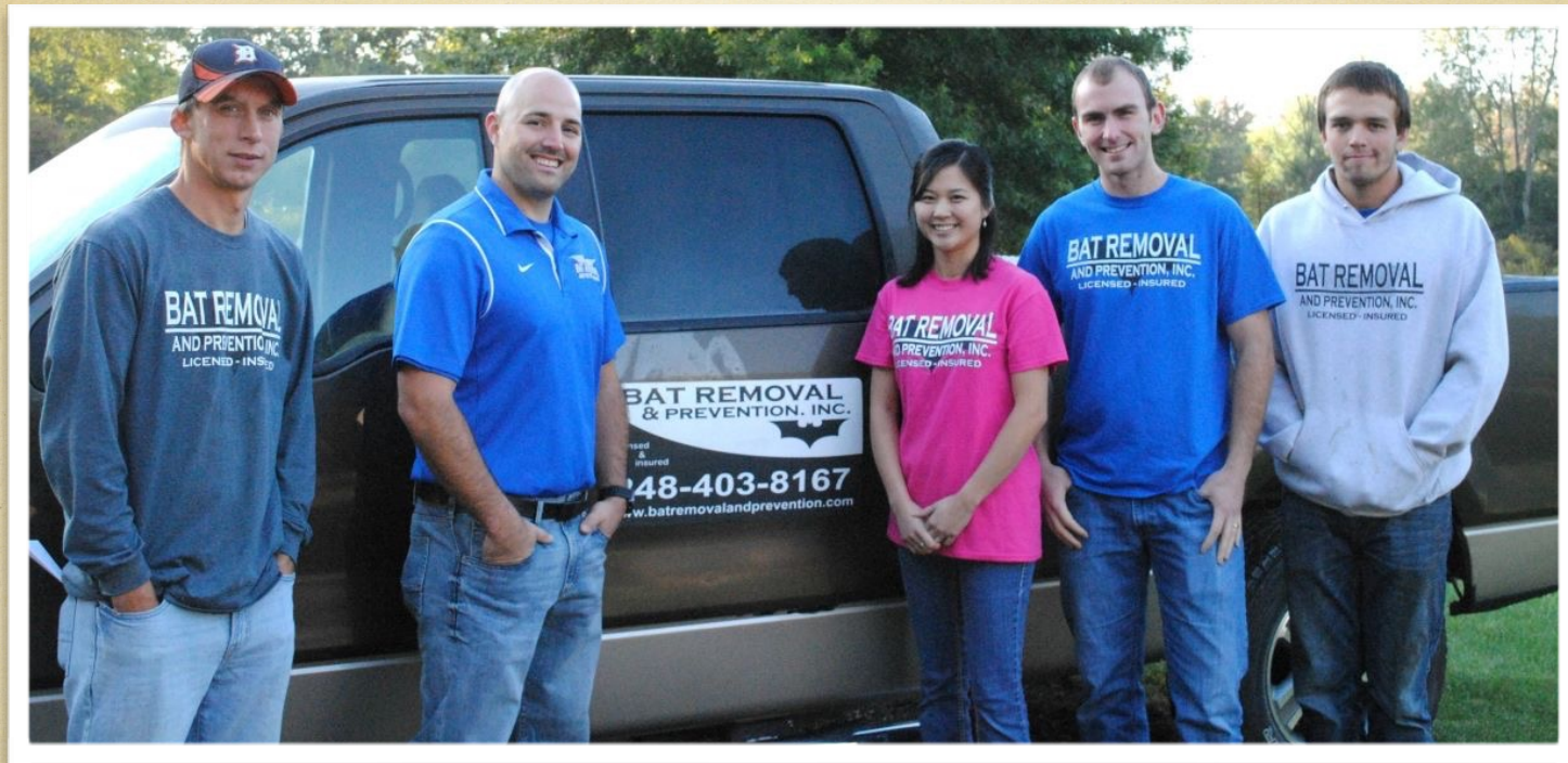
– Bat Removal and Prevention, Inc.